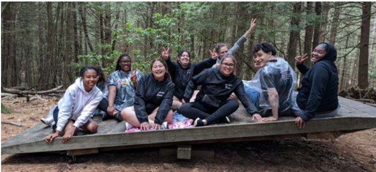
Youth leaders led trainings in transformative justice across the state, visited other youth organizing groups and made sure to spend time outside deepening our relationships.