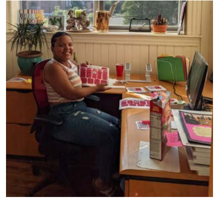
Youth leaders and alumni staff laid a powerful foundation this year for our big move to our new building in Fall 2023!